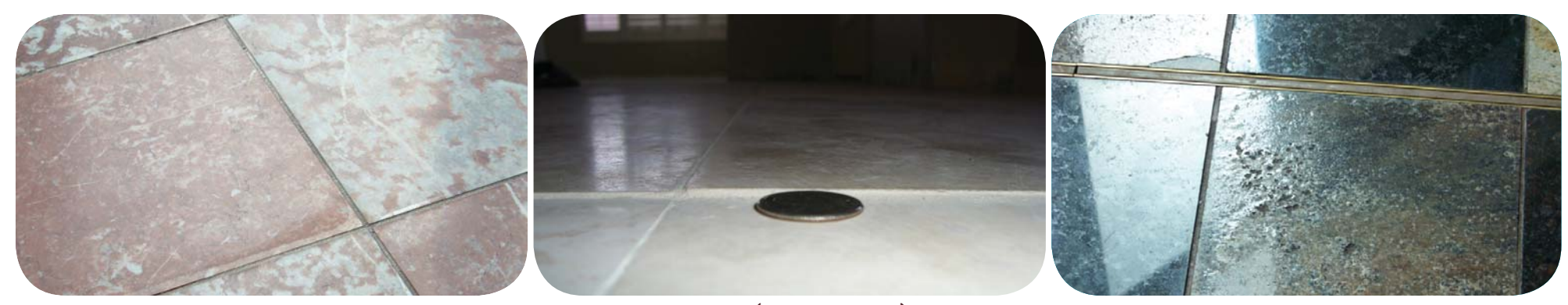
DIRTY, STAINED GROUT LINES