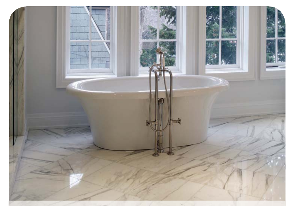
One of the great things about natural stone is that most problems can be resolved—and your stone can look as good as the day it was installed!

Efflorescence appears as a white powdery residue on the surface of the stone. It is a common condition on new stone installations or when the stone is exposed to a large quantity of water, such as flooding. This powder is a mineral salt from the setting bed. To remove efflorescence do not use water. Buff the stone with a clean polishing pad or